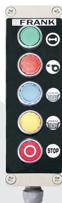
MSE-Z remote control