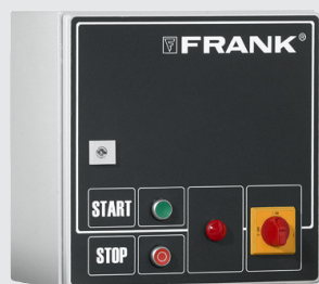
Main switch cabinet MSE-Z