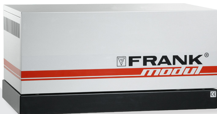
Unheated MSE-Z wall module